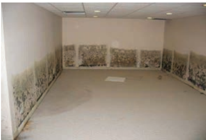
Flooded or Damp Basements