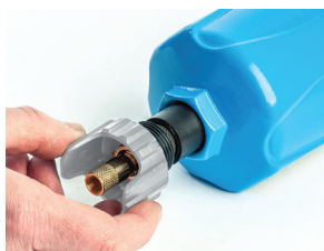
NEW Externally Accessible Drain

New Alpha deep pleated media technology delivers a step change in performance