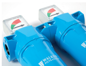
NEW Modular Filter

With class leading performance and exceptional results in oil aerosol and particle retention, the New Alpha delivers significantly reduced pressure loss and optimum filtration efficiencies - to ensure continually low operational costs.