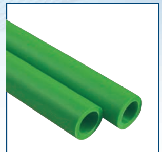
Chilled Water Quick Connect Piping