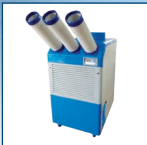
Spot Cooler: Portable A/C Water Cooled AC Solutions